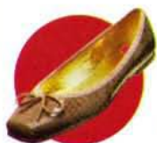
FANCY FLATS: OK AT ALL OFFICES London Sole, $245