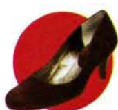
NOT SO SEXY, BUT VERY CHIC Banana Republic, $120