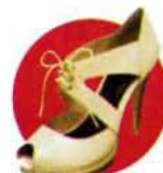
ONLY FOR THE FASHION FIELD! Bakers, $90

work quickie For office-glam clothes and makeup suggestions—plus deal alerts—check out corporette.com .