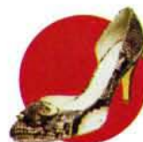
FINE WITH A LOW-KEY OUTFIT AK Anne Klein, $79