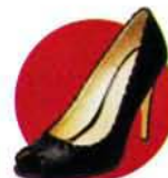
FOUR INCHES? PROBABLY TOO SEXY Victoria's Secret Catalogue, $75