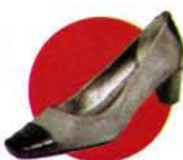
GOTTA LOVE COMFORT PUMPS Easy Spirit, $75