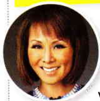
Alina Cho, CNN national correspondent and host of Fashion: Backstage Pass

“Especially in creative environments, the workplace fashion rules have loosened: You can mix two totally different prints together , like a fitted floral dress with a thin leopard-print belt. Animal prints can be a great accent for your accessories, whether on your scarf, belt or shoes. Just keep jewelry to a minimum and stick to a simple color combination that doesn't compete or clash with the print.”