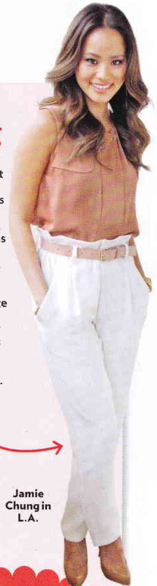
Jamie Chung in L.A.

Think easy but not sloppy. Sleeveless tops and dresses, silky trousers and flats are good options. Steer clear of anything supercasual, like graphic tees, sweatshirts or sneakers, says Sophie Wood, founder of Workchic.com.